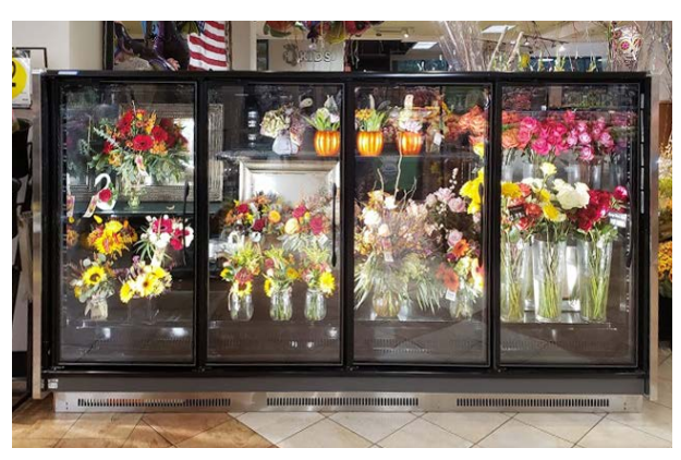
VNRBS case configuration with (2) 18" deep shelves is intended for non-critical temperature floral applications only.

Please consult Hillphoenix Engineering Reference Manual for dimensions, plan views and technical specifications. Specifications subject to change without notice. Designed for optimal performance in store environments where temperature and humidity do not exceed 75° F and 55% R.H. Certified to UL 471 and ANSI/NSF Standard 7.